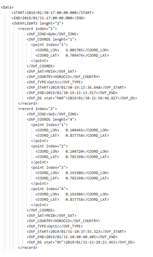
Figure 3: Example of XML file generated by Overflight

- Overflight XML file including a summary of all the relevant information of the analysis in XML format.